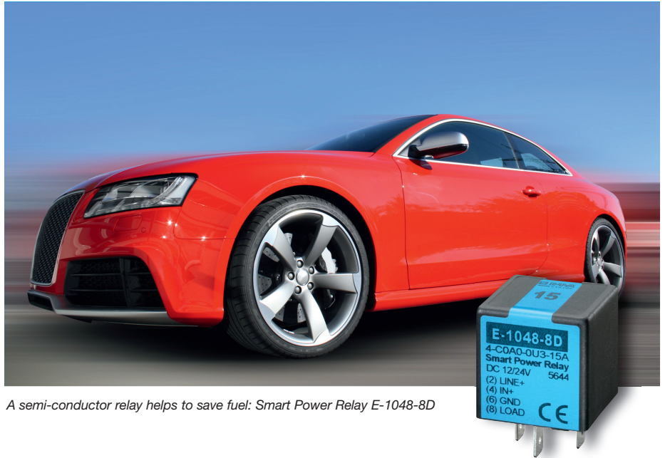
A semi-conductor relay helps to save fuel: Smart Power Relay E-1048-8D

operation as well as the suitability to include additional functions and benefits (e.g. overcurrent protection, delayed trip behaviour, bus connection...)